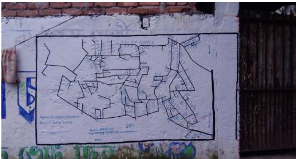
One of the ATU wall maps used to locate houses within the slum at Panchanatala, Kolkata, West Bengal (August 2015)

The Indian post office (India Post) now delivers directly to people who previously had to pick up their mail in a communal location (such as a community hall or well-known shop as previously).