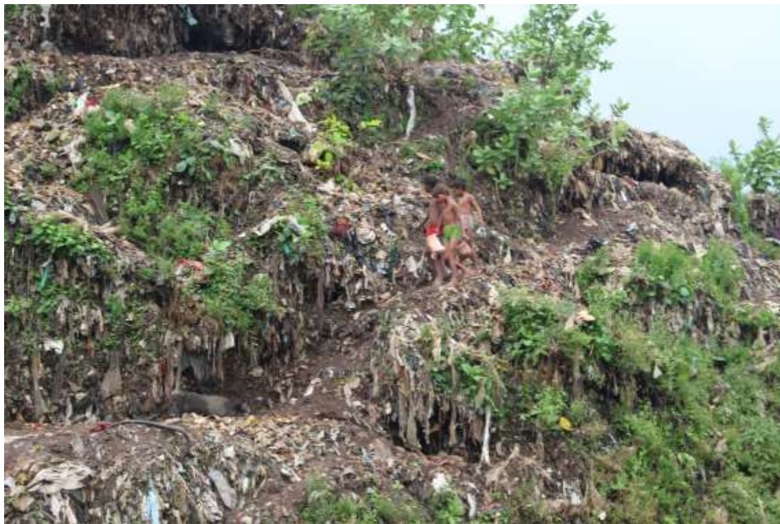
Children scavenge for recyclable materials (e.g. small vaccine bottles) at Bhagar dump, Kolkata, West Bengal (August 2015)

We have attached six case studies in order to demonstrate to our readers, what the people we have helped say about our work.