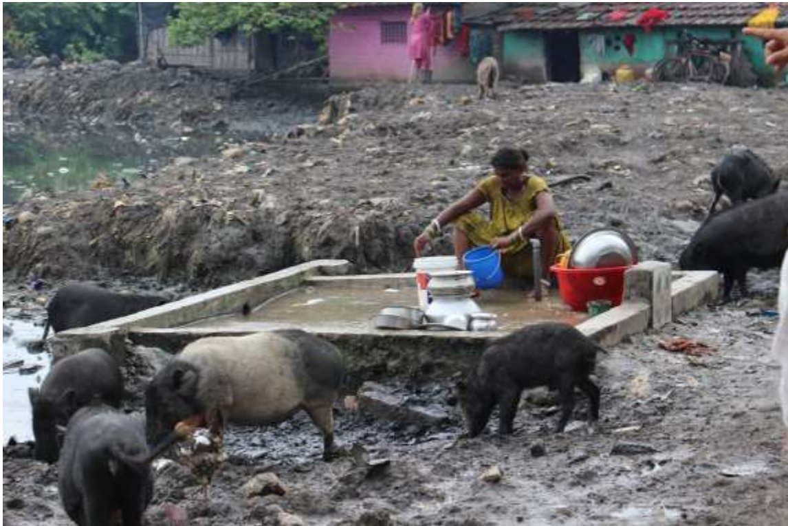
Washing facilities at Bhagar dump slum, Kolkata (August 2015)