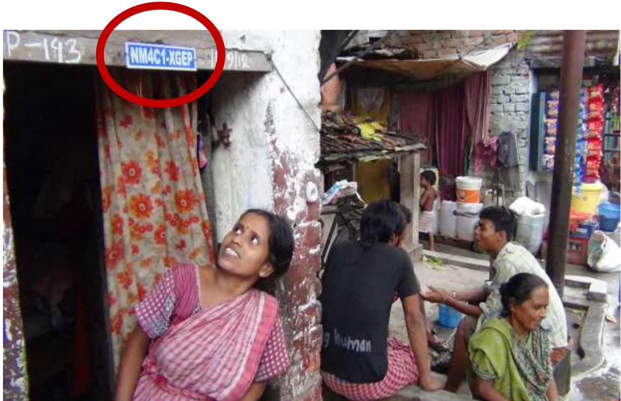
A happy resident of Chetla slum, Kolkata, West Bengal (April 2014)