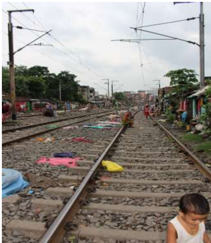
The railway line which runs through Panchanantala slum (August 2015)

In addition we will use some of these funds to enable us to train NGOs and slum dwellers working in other cities in India and all over the world to carry on our work