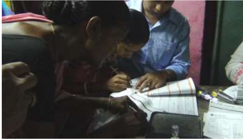
Addressing the Unaddressed and The Hope Foundation organised bank account opening event Chetla, Kolkata (2013)

Residents have the ability to open bank accounts while bank managers now are using our online database system for their KYC requirements.