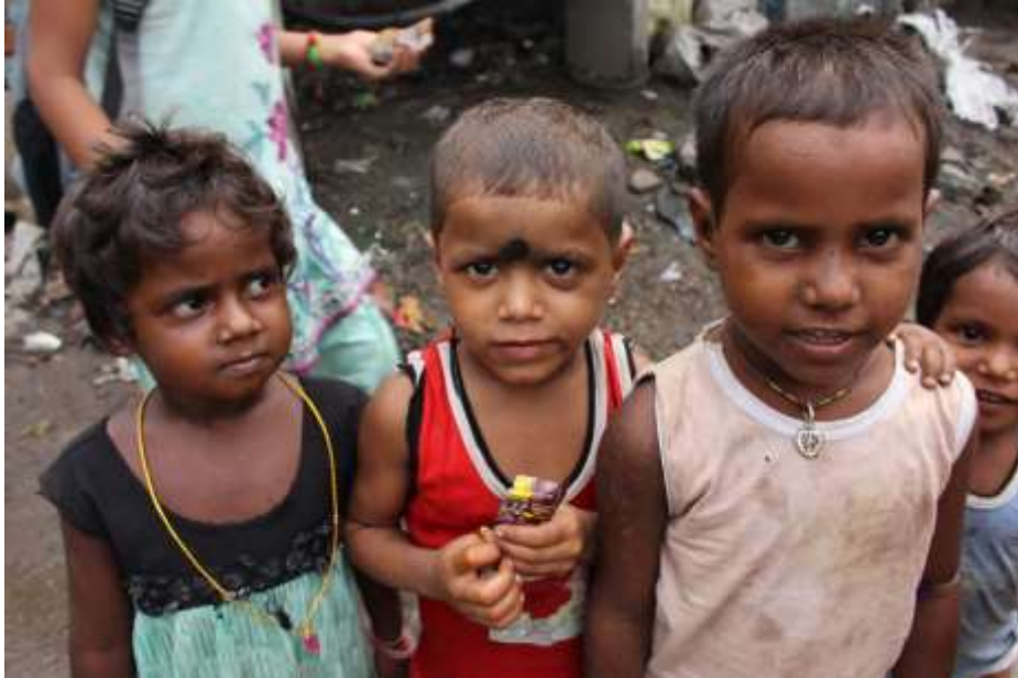
Children of Chitpur slum, Kolkata, India (August 2015)