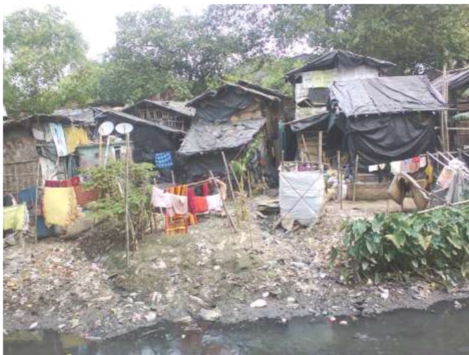
Chetla slum, Kolkata, West Bengal (circa 2013)