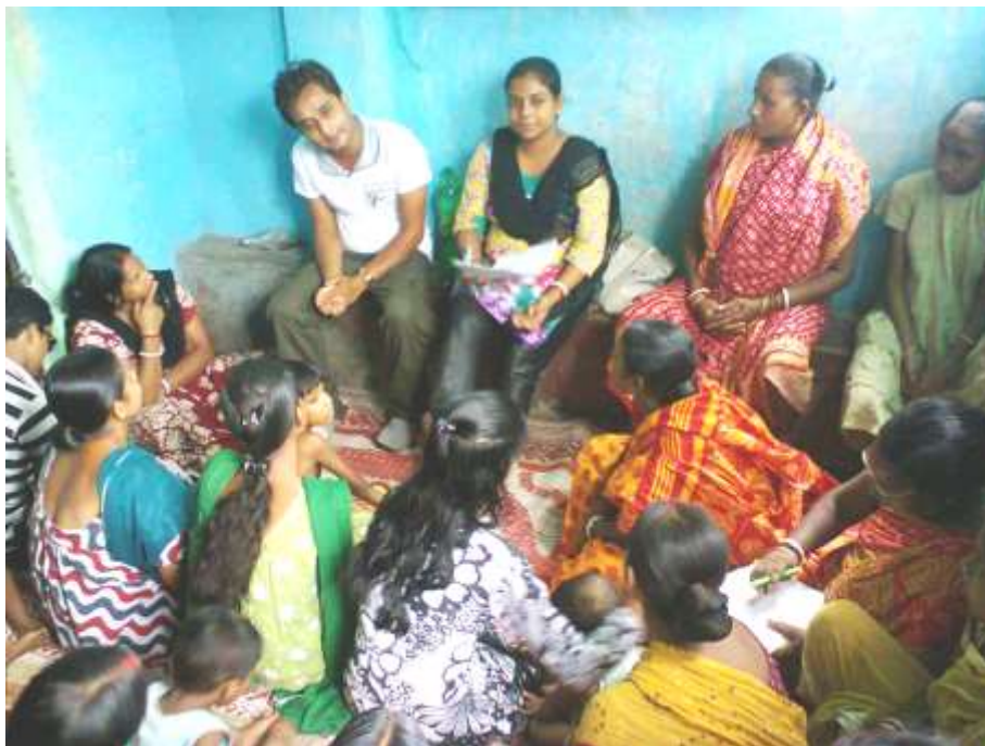
A community information meeting, Chetla, Kolkata, West Bengal, April 2014

In the last 12 months we have addressed a further 10,000 dwellings which means that now almost 16,000 dwellings have been addressed giving over 43,000 people a better identity.